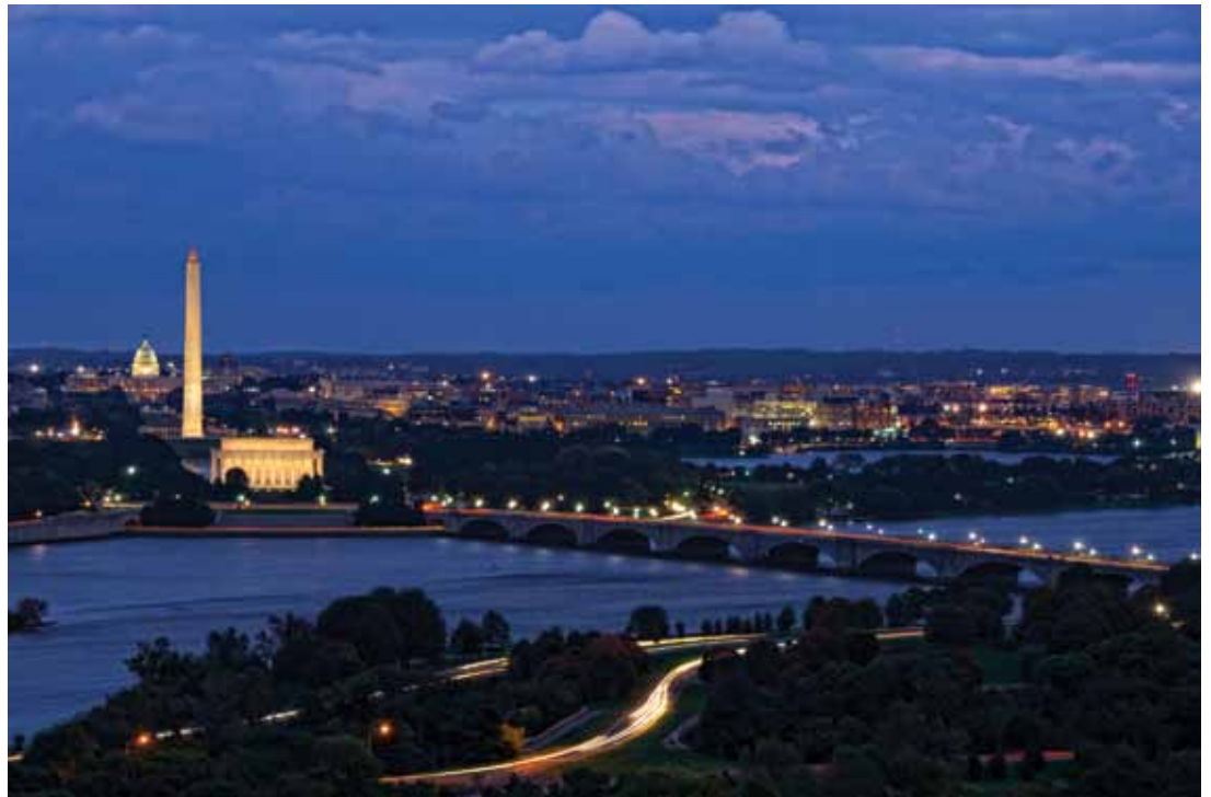
A view of Washington, D.C., at twilight showing the Potomac River and the Memorial Bridge connecting Arlington, Virginia, and the District of Columbia.