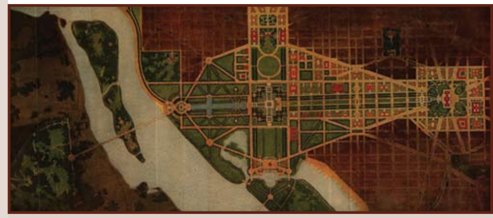
The vintage map above shows the National Mall, directly across the Potomac River from the Northern Virginia suburb of Arlington, home to the law school.

3301 Fairfax Drive Arlington, Virginia 22201